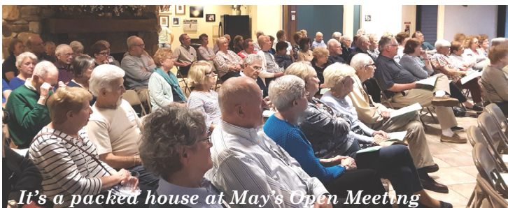
It's a packed house at May's Open Meeting

The next open meeting of the Jefferson Village HOA will take place on Wednesday, November 13, 2019 at the HM Community Center. Be sure to add that date to your calendars.