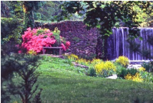
Old photo of Hershey's Mill Dam when it had water running over it. Some residents have never seen this. At this time the dam has been breached and is scheduled for redevelopment.